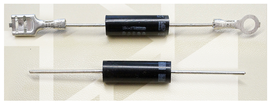
To order with quick disconnect terminals, use the partnum-TERM